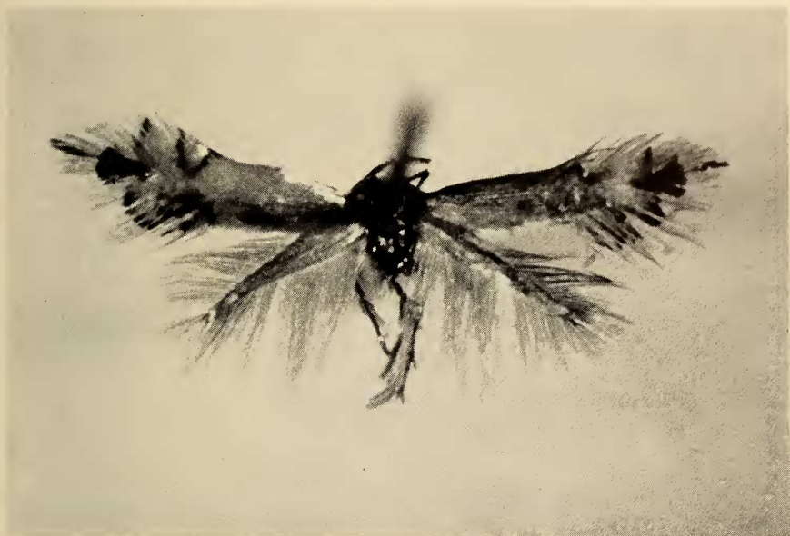
Fig. 4. Coptodisca matheri n.sp., upperside of holotype.

This is the most lightly coloured species of those which feed on plants of the Heath family. Coptodisca matheri can be separated from C. arbutiella Busck (1904: 769) and C. kalmiella Dietz (1921: 44) by the lack of the dark lead ground colour on the basal half of the forewing present in arbutiella and kalmiella . The comb on the valve of the male genitalia of matheri has 6 teeth, not 7 to 9 as in arbutiella and kalmiella .